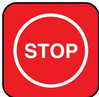
STOP SIGN (RED)